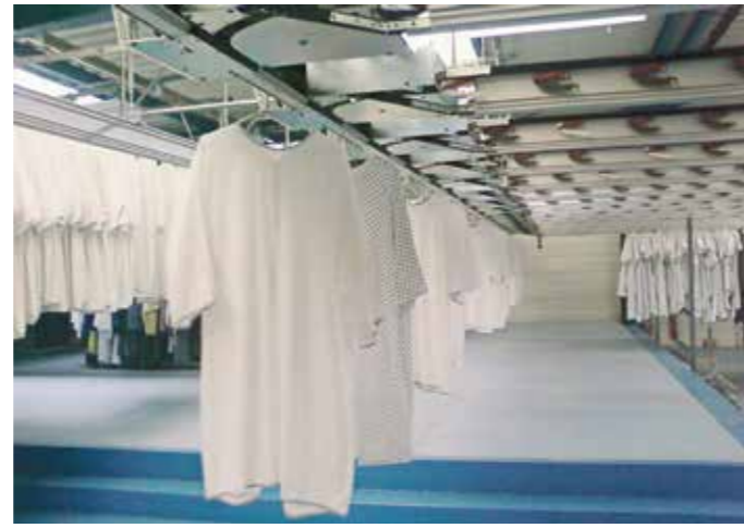
Sorting to different locations at a laundry.