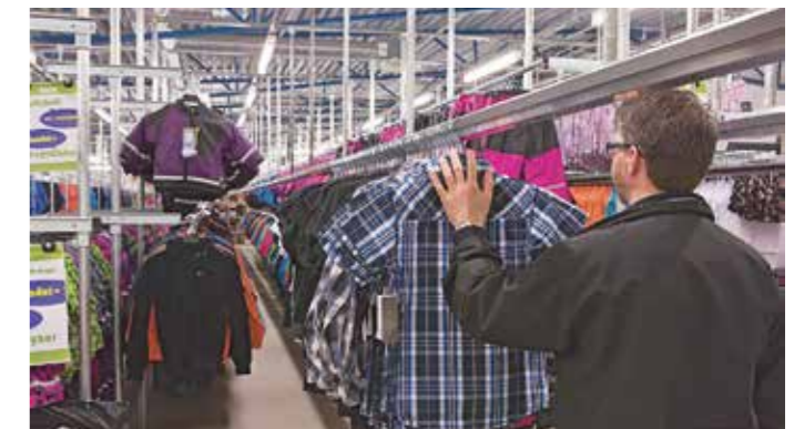
Easy to manually push many items simultaneously, due to the plastic covering on the slide rail.