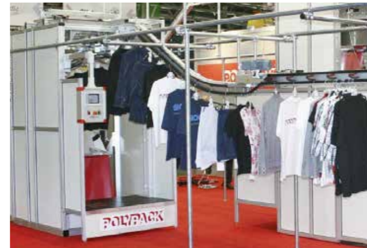
Automatic feeding into a bagging machine.