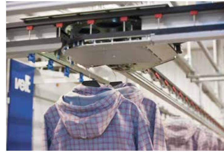
Patented automatic switches, without loss of height.