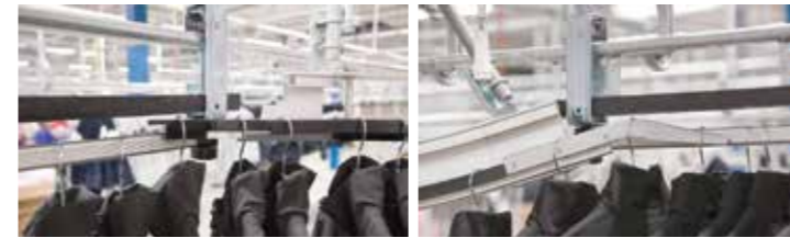
Loading and unloading. Linking of the Slide Rail system to the Trolley system is the most cost effective way of bridging long distances to the static stock.