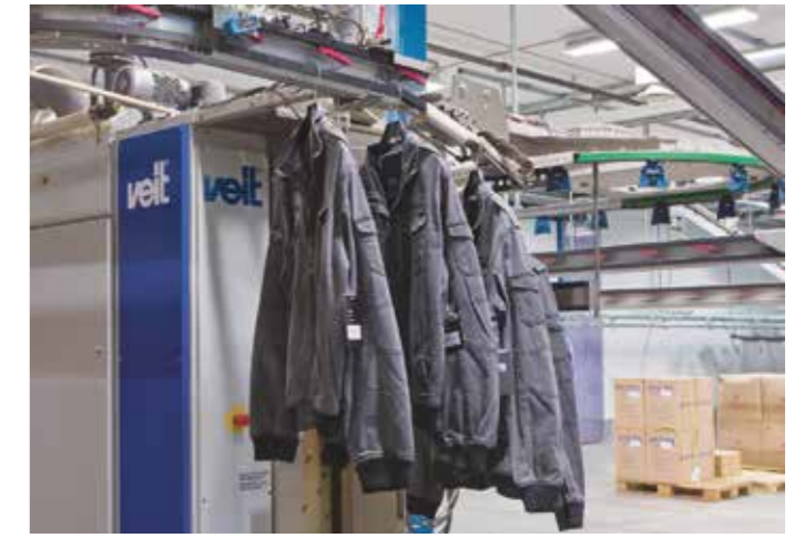
Automatic feeding into a tunnel finisher.