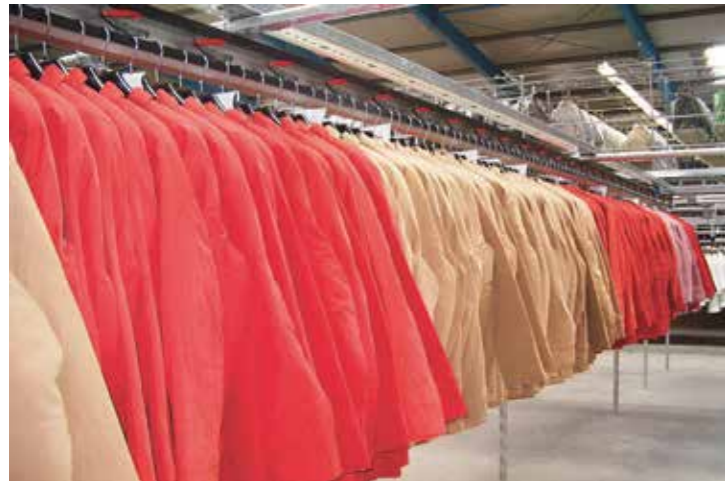
The TX 200 has been designed to store great quantities of products without any pressure on the waiting garments.