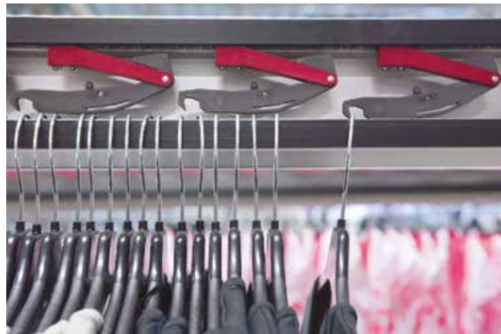
TX 200 as a "power and free" conveyor. Large quantities of goods can be accumulated and then picked from the front one by one.