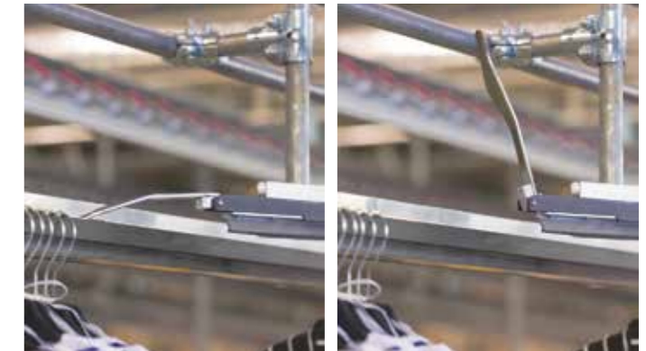
The simple and reliable switch changes the direction of flow.