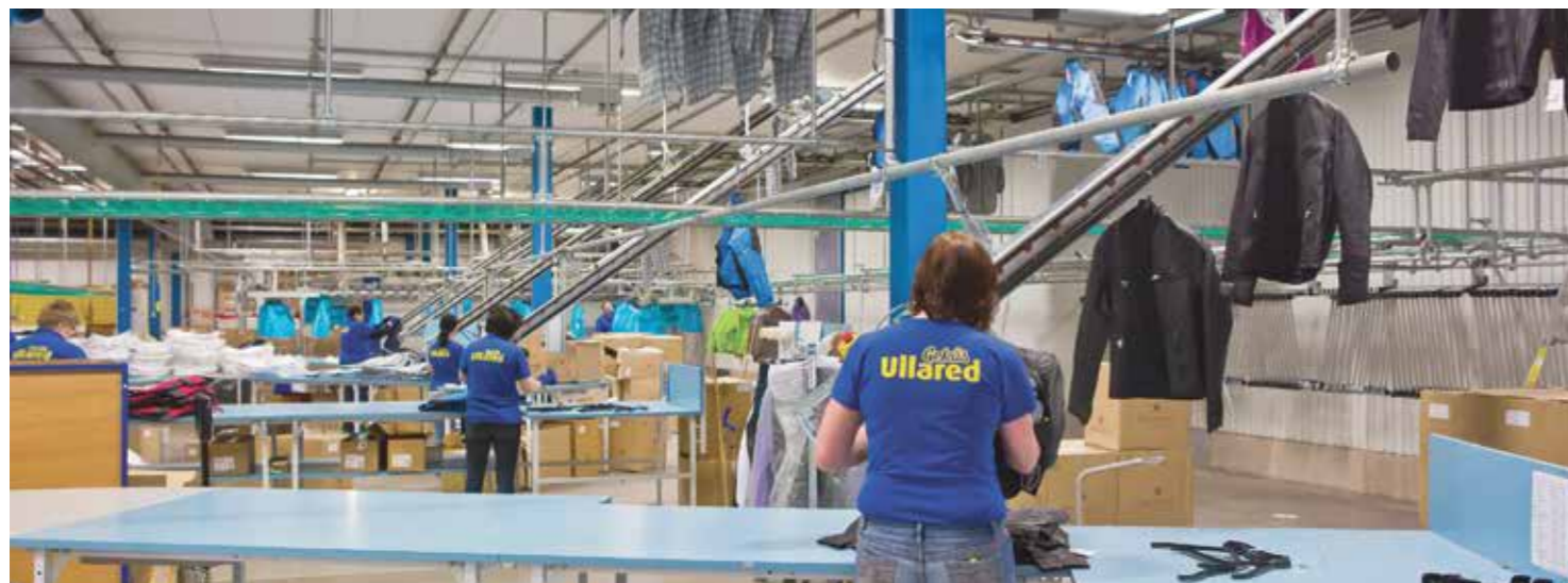
Unpacking station, where the garments are fed into the conveyor system.