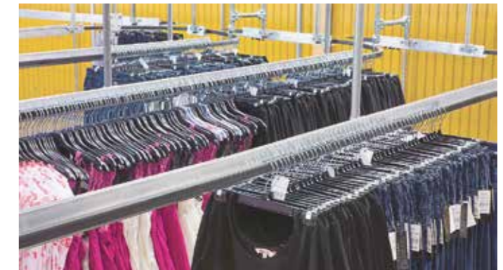
Arrival and departure buffer.